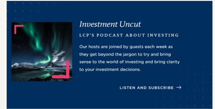
Subscribe to LCP Podcasts | LCP Ireland