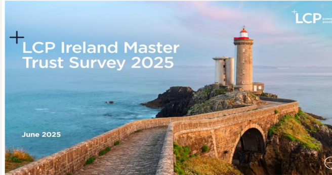
LCP Ireland Master Trust Survey 2025