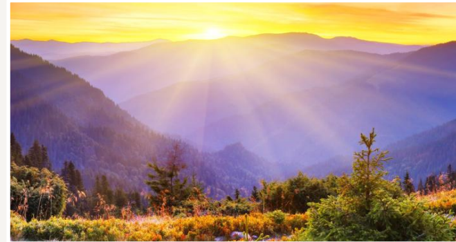
LCP Ireland Investment Essentials Webinars

This generic note should not be relied upon for detailed advice or taken as an authoritative statement of the law. If you would like any assistance or further information on the contents of this generic note, please contact the partner who normally advises you.