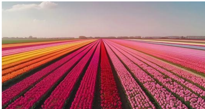
LCP Responsible Investment Survey