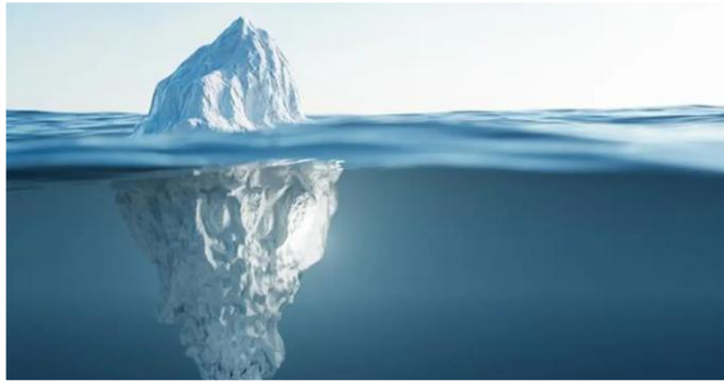
Investment Management Fee Survey